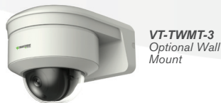
VT-TWMT-3 Optional Wall Mount