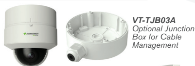
VT-TJB03A Optional Junction Box for Cable Management