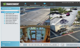
Local Management, Viewing Interface & Remote Viewing with Web Browsers