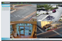
Remote Viewing Using Mac OS X